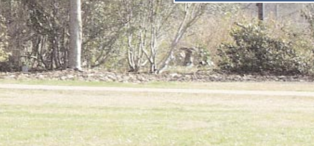
Above: Noah's Ark Rehabilitation Center and Children Care Homes, provides shelter and caring for 1,000 animals and a dozen children in need of foster care.