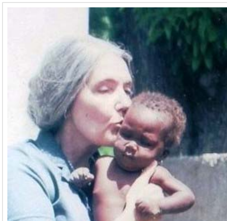
"Hopefully our legacy has been to infuse people with the desire to know God"